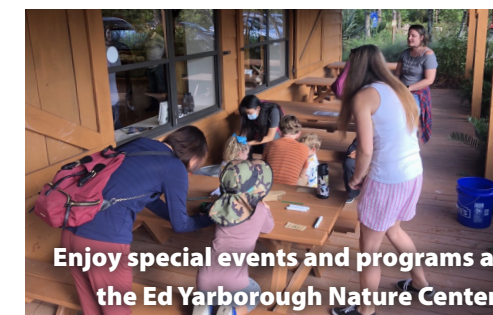
Enjoy special events and programs at the Ed Yarborough Nature Center.

Bring Natural Lands to a special event, school night or other celebration. Staff and volunteers will bring an event booth full of fun and exciting items including skulls, pelts, educational materials, and of course, live animals!