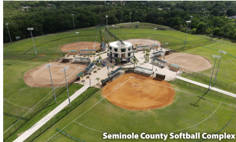
Seminole County Softball Complex

Free of charge; Balls available in-office. First come, first serve. Open dawn to dusk.