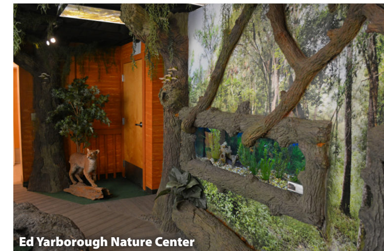
Ed Yarborough Nature Center