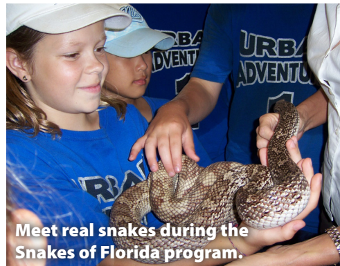
Meet real snakes during the Snakes of Florida program.

Date/Time: Saturday, March 9, 9:00 a.m.–