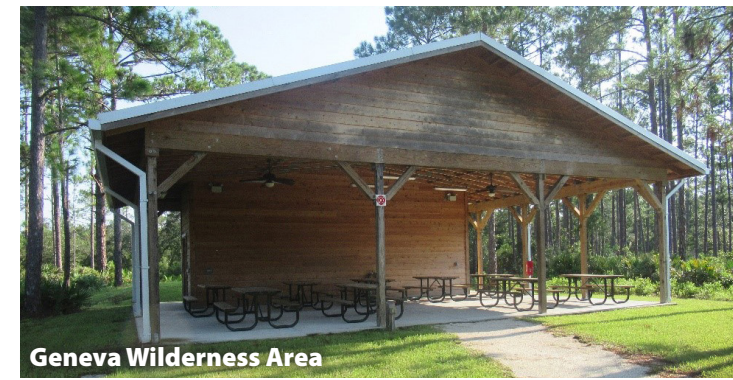
Geneva Wilderness Area

For more information, please call the Geneva Wilderness Area at (407) 665-2211