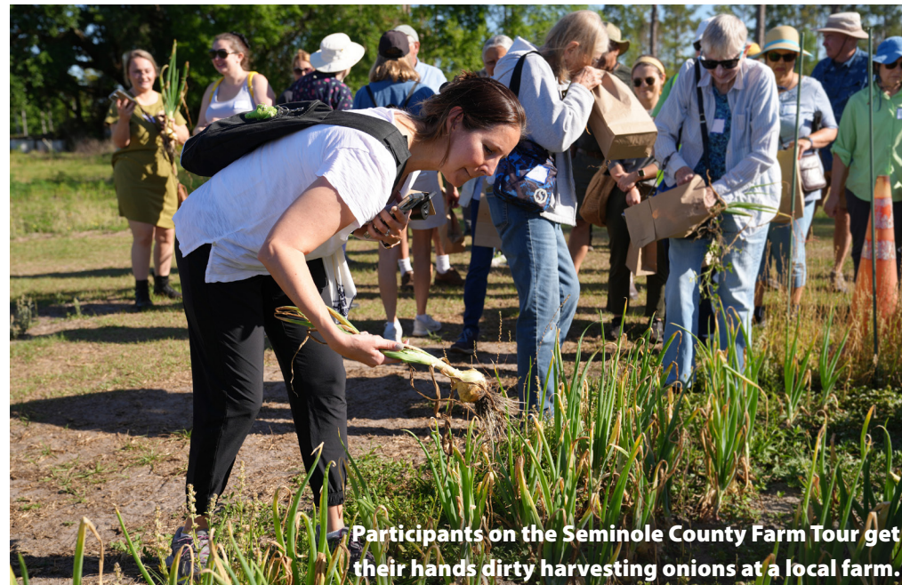
Participants on the Seminole County Farm Tour get their hands dirty harvesting onions at a local farm.

Cost: $10 per workshop or all 6 for $35.