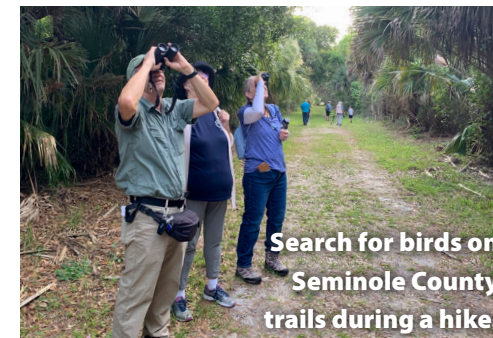
Search for birds on Seminole County trails during a hike.