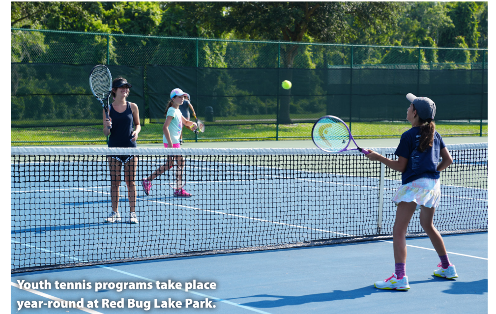
Youth tennis programs take place year-round at Red Bug Lake Park.