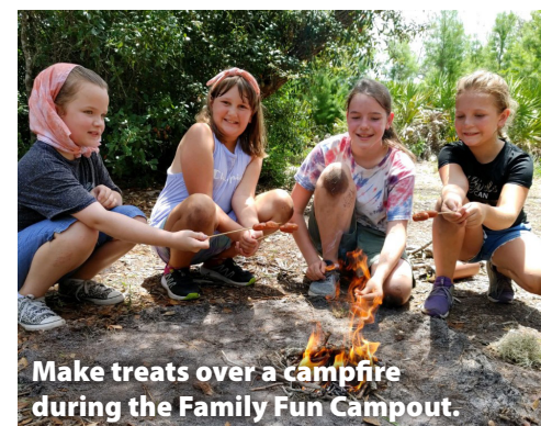
Make treats over a campfire during the Family Fun Campout.