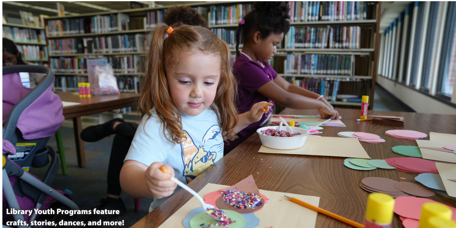
Library Youth Programs feature crafts, stories, dances, and more!

All programs and events listed here are FREE! Register and view the full calendar at seminolelibrary.org .