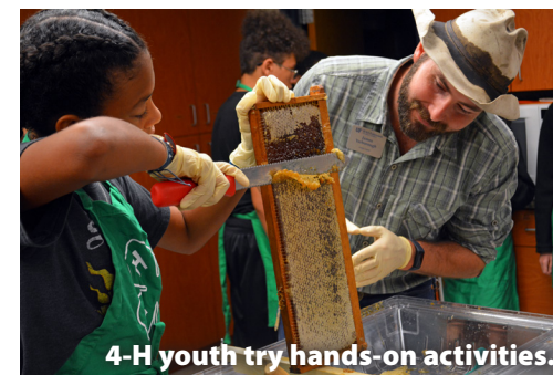
4-H youth try hands-on activities.

4-H is the UF IFAS Extension's youth development program as part of Florida 4-H. Inspiring kids through hands-on learning